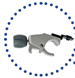
C-Clamp Bracket PN 190297-200