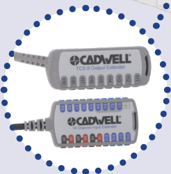
TCS-9 Output Extender PN 362068-000 16 Channel Input Extender PN 362071-000