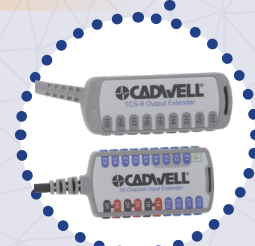
TCS-9 Output Extender PN 362068-000 16 Channel Input Extender PN 362071-000