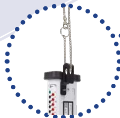
Pocket Chain With Trigger Snap for Limb Modules PN 067005-000